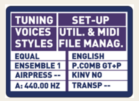
Initial instrument display

A comprehensive range of instrument management is available to the player without the need for a computer link up. The features are controlled through a display that can be readily seen at the console.