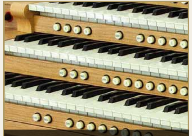
Fatar style TP60LW solid wood filled cream and ebony keyboards

Fatar style TP60LR white and black plastic keyboards